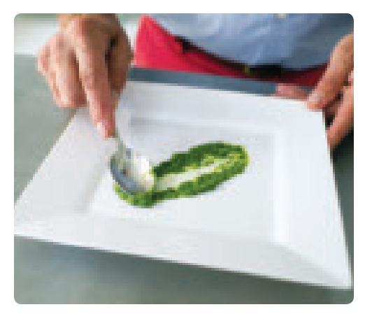
Use the back of the spoon to smear the pesto across in one motion and one line. It should look something like a comet.