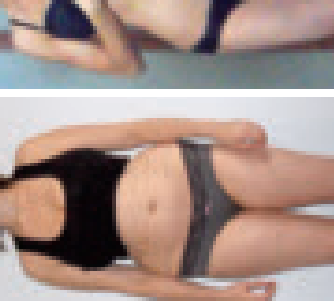
Before: 34% body fat. After: <20% body fat.