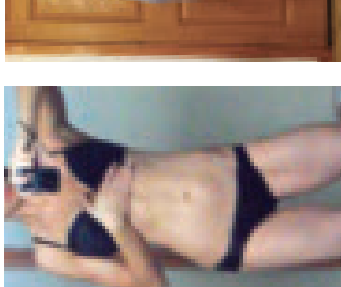
Before: Size 24+. After: Size 4 petite (125+ lbs lost).