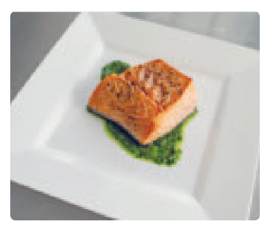
Put your food on top of, or on either side of, the comet. Serve.