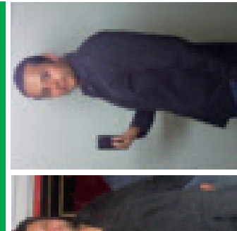
Before: 410 lbs. After: 246 lbs.